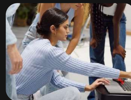
working with a stylist

The system analyzes each client's preferences and booking history to provide personalized recommendations.