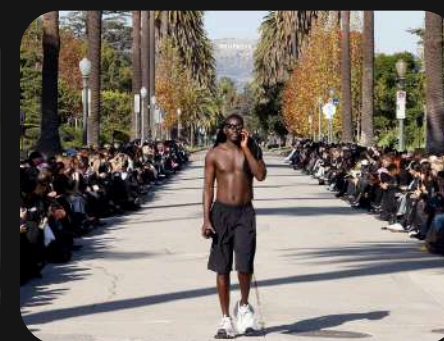
tickets to shows