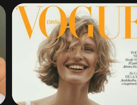
placement on the cover